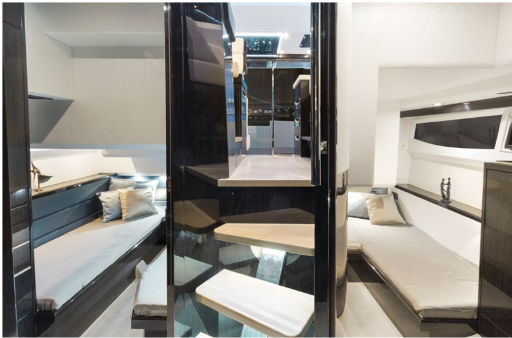
— Wide steps lead to cabins down below