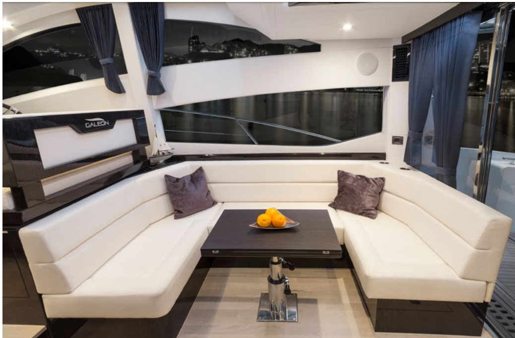
A sizable dinette will seat plenty