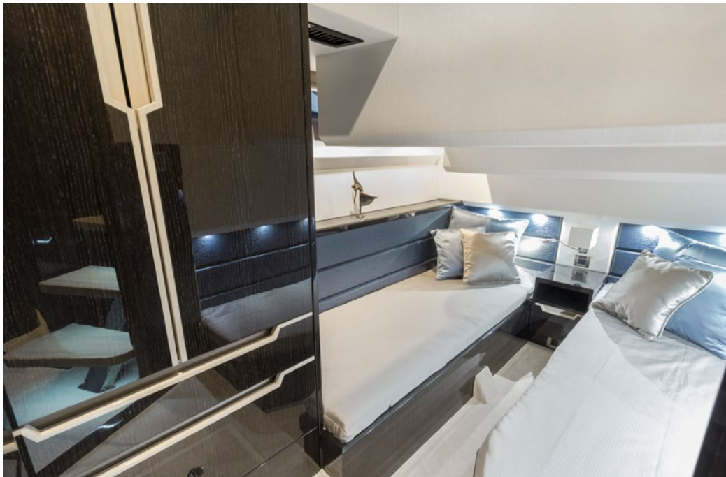
— Twin guest cabin