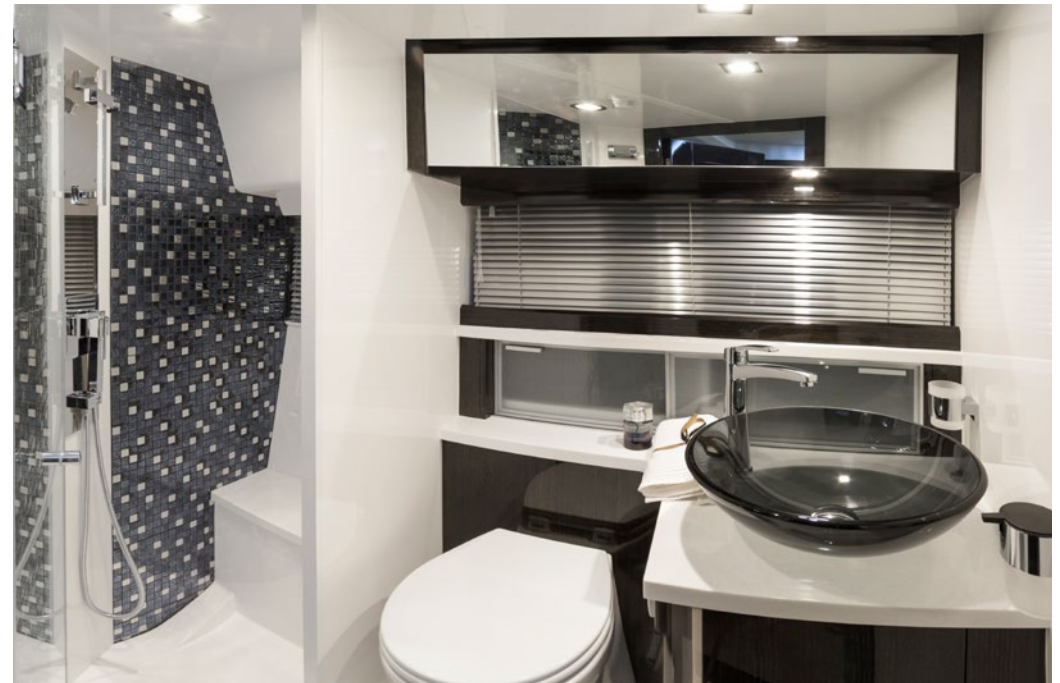
— A full-sized, enclosed shower in one of the bathrooms