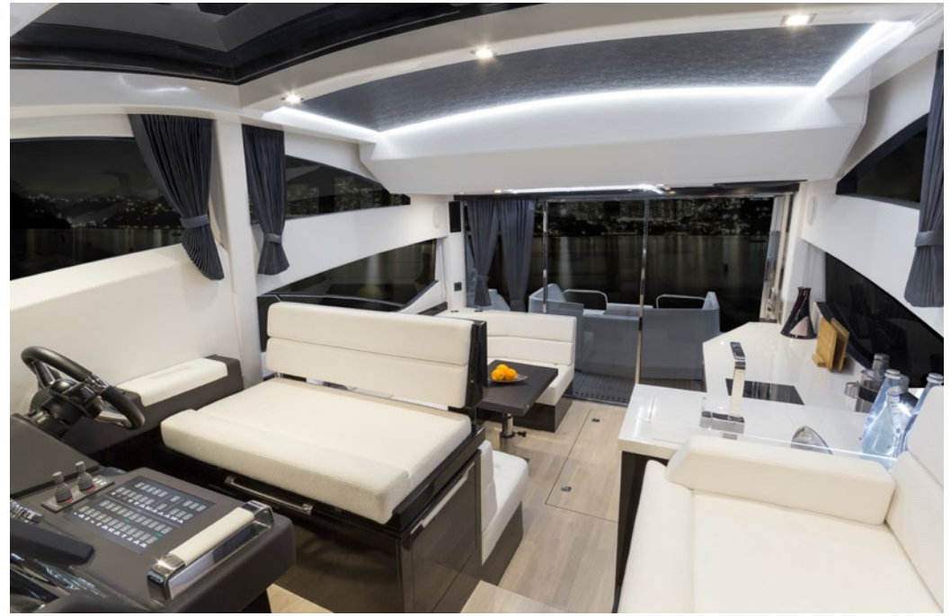
Saloon with galley moved back