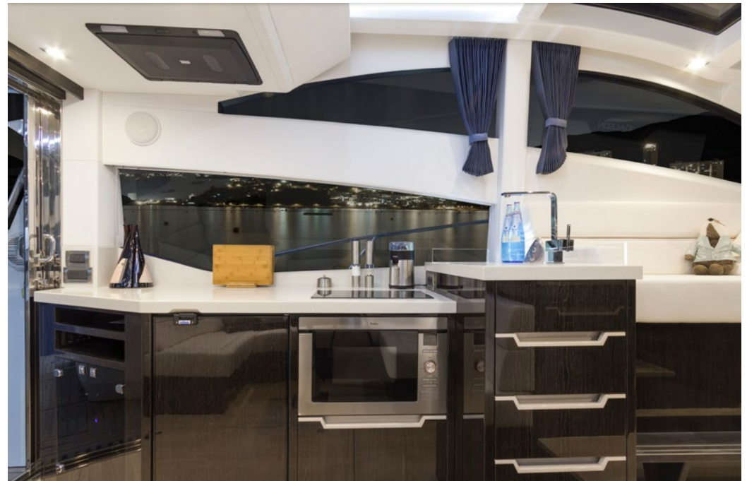
Functional galley area