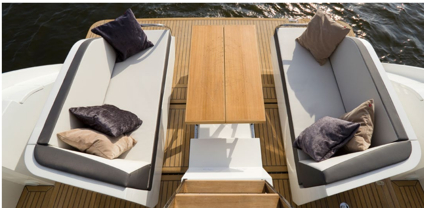
Transformable cockpit seating