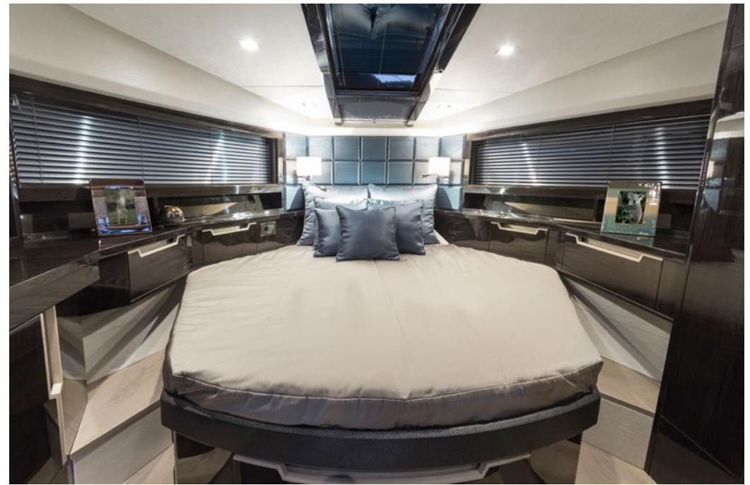
— Forward owner's cabin