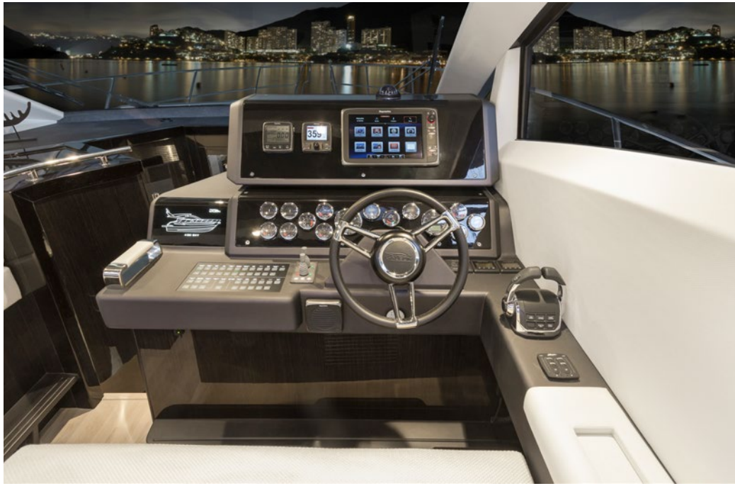
The main helm station