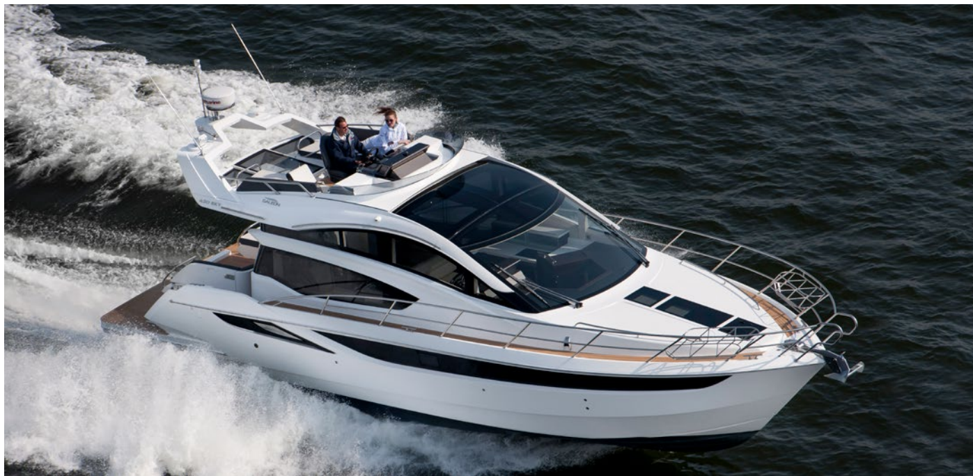
The SKYDECK features both a top deck and a sunroof over the helm