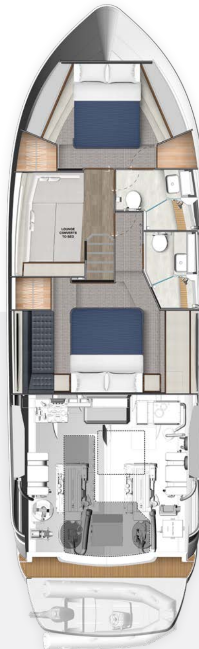
ACCOMMODATION DECK Shown with optional foldout bed