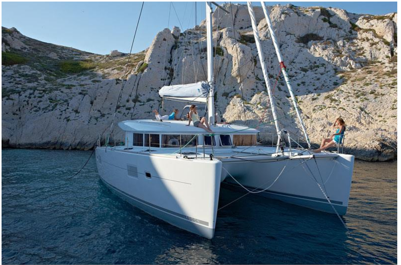
Lagoon 400 - Marseille juin 2009