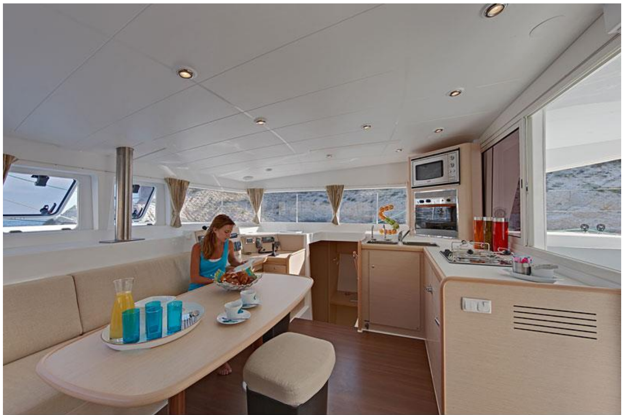
Lagoon 400 - Marseille juin 2009