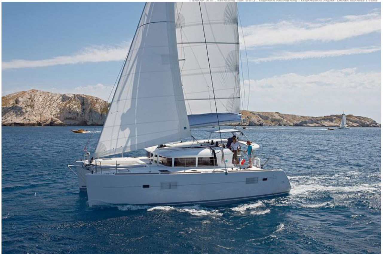
Lagoon 400 - Marseille juin 2009