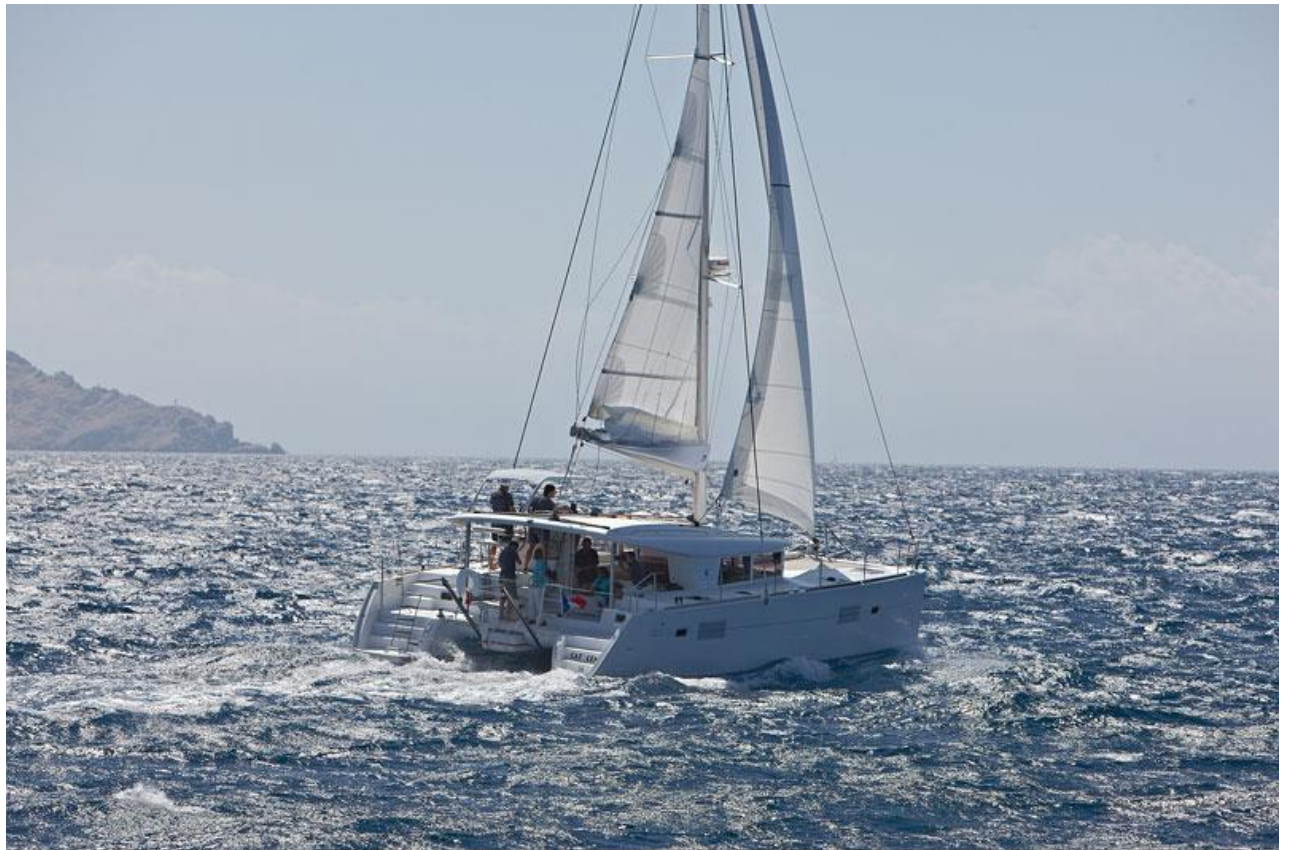
Lagoon 400 - Marseille juin 2009 - Mention obligatoire / Mandatory credit: Photo Nicolas Claris

Battened mail sail with lazy jacks & roller furling genoa, steering wheel, convertible table in the salon, electric windlass, deck shower, wind instruments, sprayhood, bimini top, GPS, Plotter, Autopilot,, RADIO/ MP3 player, CD player, cockpit speakers, electric fridge, warm water, fuel tanks water tanks, dinghy, full set of electronic instruments, complete safety & galley equipment.