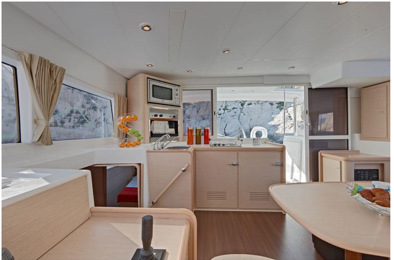
Lagoon 400 - Marseille juin 2009 - Mention obligatoire / Mandatory credit: Photo Nicolas Claris