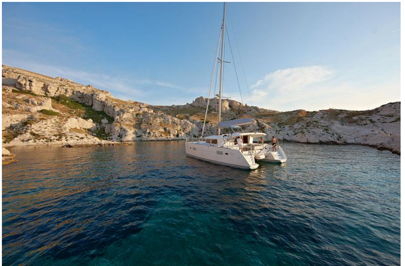
Lagoon 400 - Marseille juin 2009