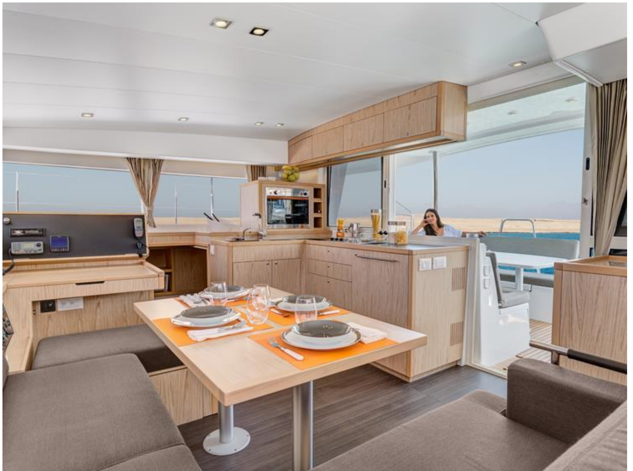
Lagoon 400 S2 - juillet 2012